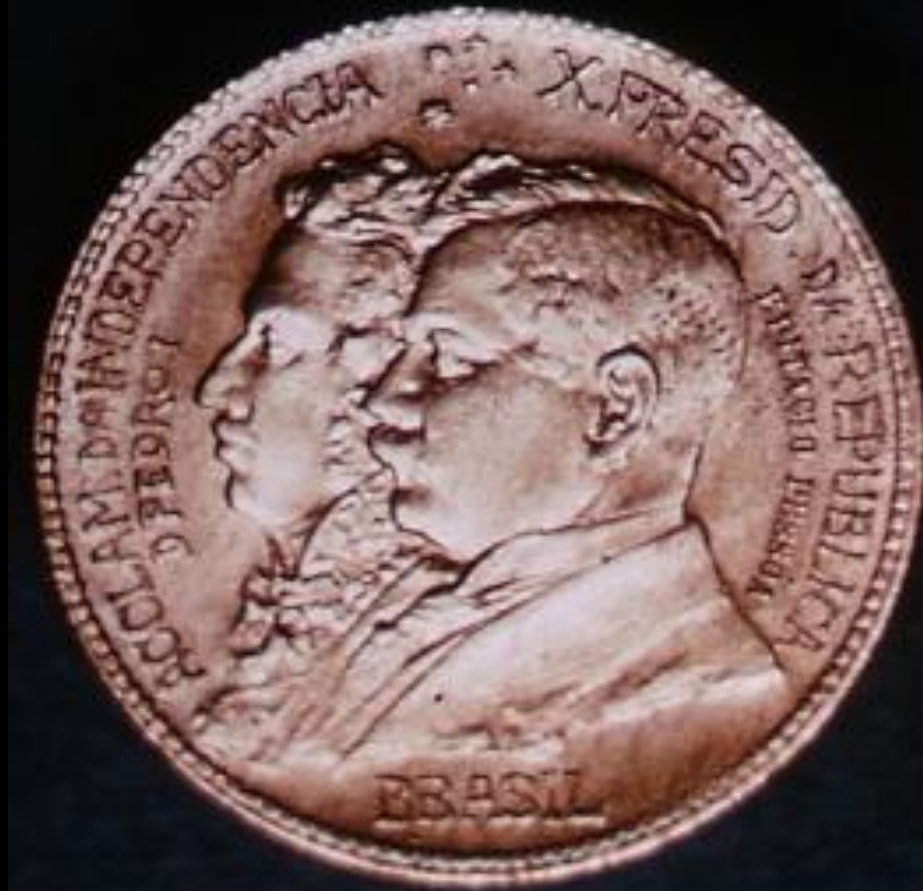
Brasil misspelled (Bbasil) at the bottom of the conjoined busts.